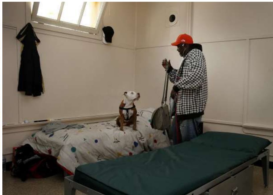
*(San Francisco Chronicle, 2015)