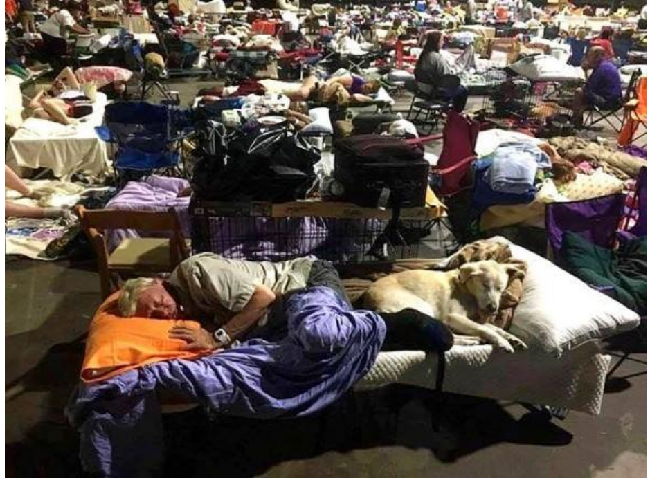
Millennium Middle School, Tarmac Florida during Hurricane Matthew.