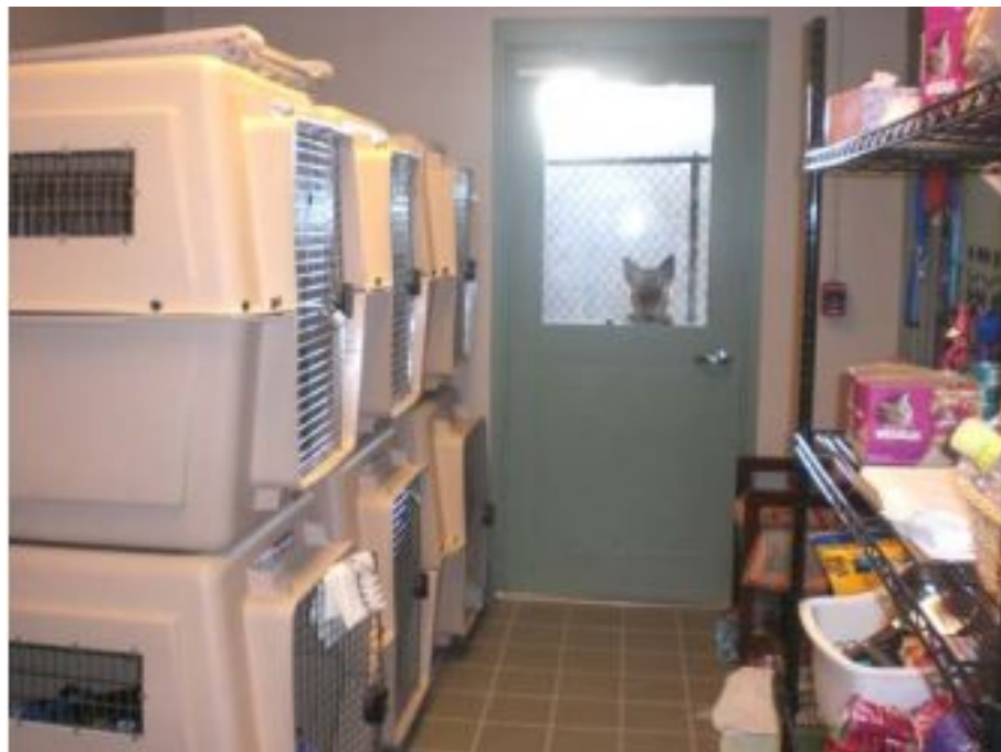
*(Sheltering Animals and Families Together, 2012)